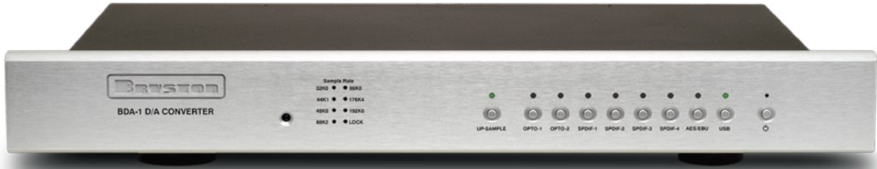
BRYSTON BDA-1 EXTERNAL DAC